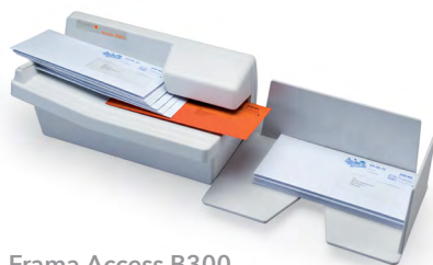
Frama Access B300

With their sophisticated slitting technique, Frama Access B300 and B400 letter openers are ideal assistants for the processing of both small and large amounts of mail. The performance range has been greatly expanded, particularly with the B400. It is the only letter opener in the world that can slit and open letters that are up to 10mm thick. If needed, letters can be opened on three sides - and all this with an attractive price/performance ratio.